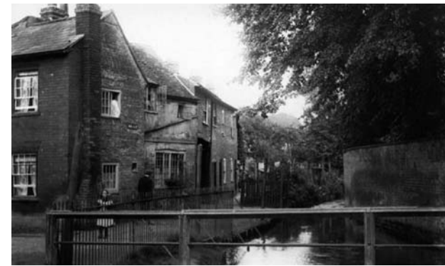
Duck Alley